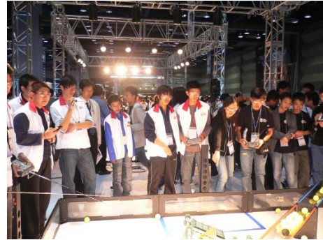
1st Asia-Pacific Robotics Championship in 2007, held in Korea.