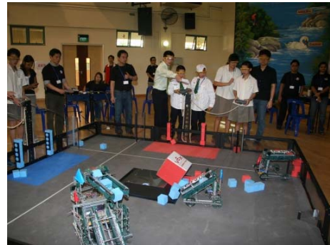
2nd Asia-Pacific Robotics Championship in 2008, held in Singapore