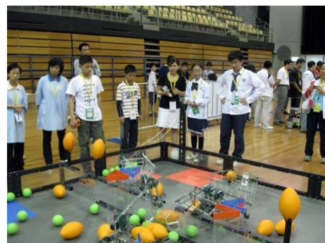
3rd Asia-Pacific Robotics Championship in 2009, held in Australia.