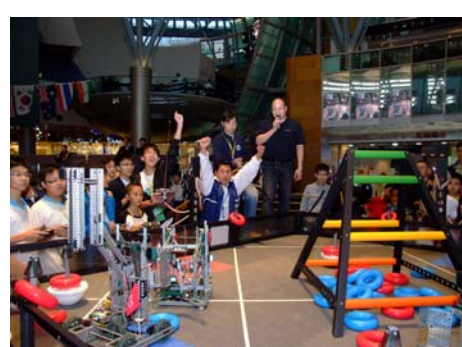
4th Asia-Pacific Robotics Championship in 2010, held in Hong Kong.

香港九龍尖沙咀東部麼地道六十三號好時中心 1 樓 11-14 室 Unit 11-14, 1/F, Houston Center, 63 Mody Road, TST East, Kowloon, Hong Kong Tel: +852 26776699 Fax: +852 26767964 http://www.asianroboticsleague.org